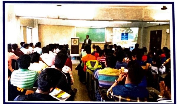
Skill World workshop on "Job skills and Part Job through Smart mobile phone" on 14th July 2017