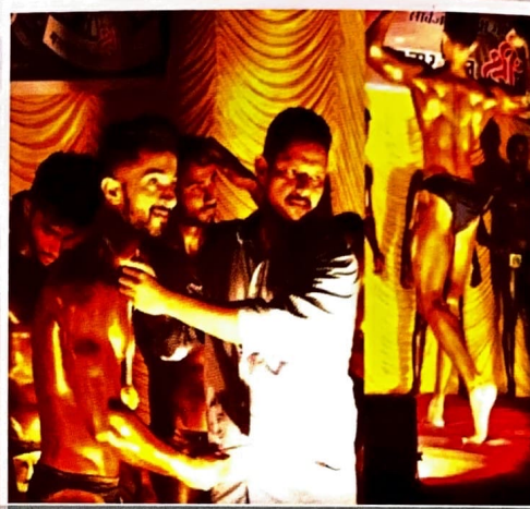
College Group Winner: Malabar Hill Shree 2017