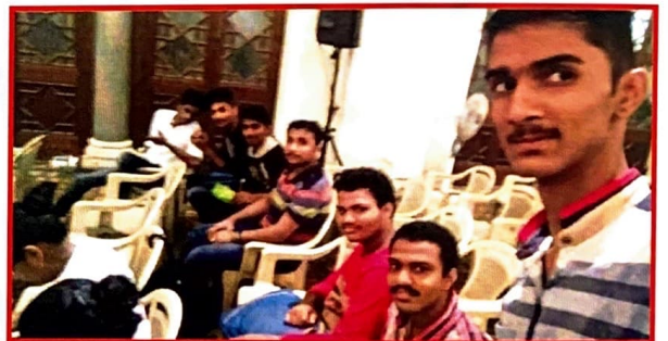
University Foundation Day at Fort campus on 17th July, 2017