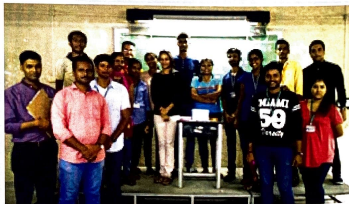
Student's Council Team of the Academic year of 2017-18

The formation of Student's Council has been done on 10/08/2017 as per University Act Section 40 (2) (a), 40 (2) (b) and 40 (4) (a).