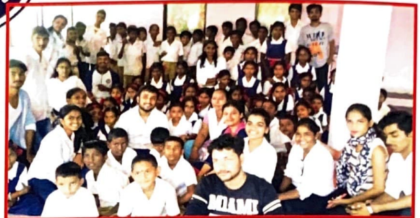
Visit to Parole Adopted village on 16th August 2017 for Swaccha Bharat Abhiyan