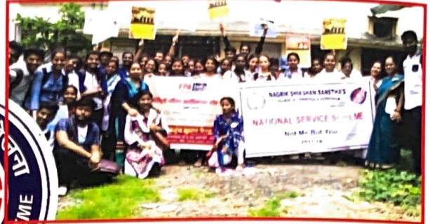
Population Day Rally on 17th July, 2017