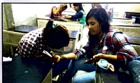
Mehandi Competition arranged by Cultural Committee on 29/09/2017