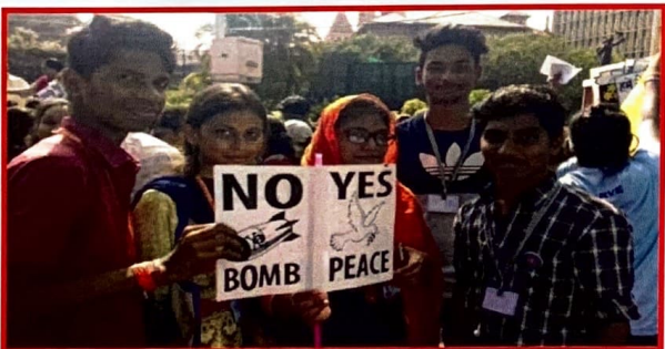
Hiroshima Peace Rally at HutatmaChowk on 5th August 2017