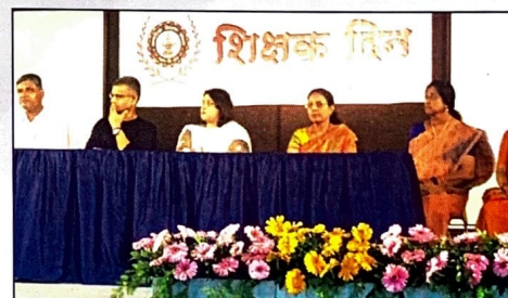
Celebrating Shikshak Din in the institution