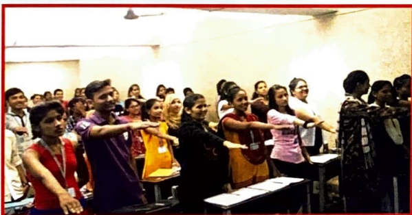
Swaccha Bharat Pledge on 3rd August 2017