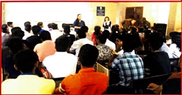
Guest lecture on Anti-Rabies on 6th July 2017