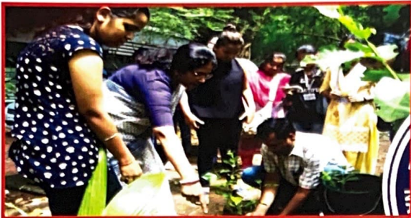
Tree Plantation in College Campus 5th July 2017