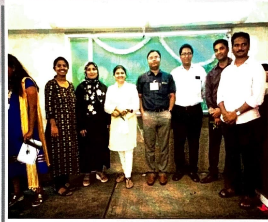
Celebrated Teacher's Day by the Student's Council