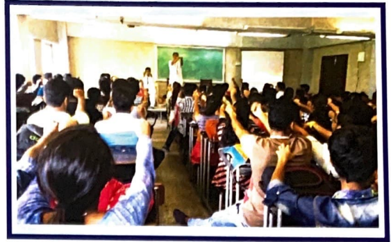
Yoga Day Celebrated with Two imminent Yoga GURUS