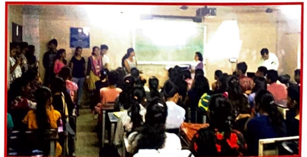
NSS Orientation Program on 10th August 2017