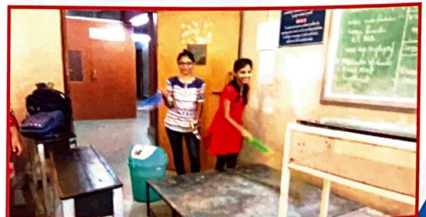
Campus Cleaning Programme by NSS on 10th August 2017