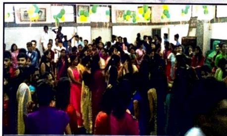
Celebration of Navratri with Garba Dance by Students Council on 28th September, 2017