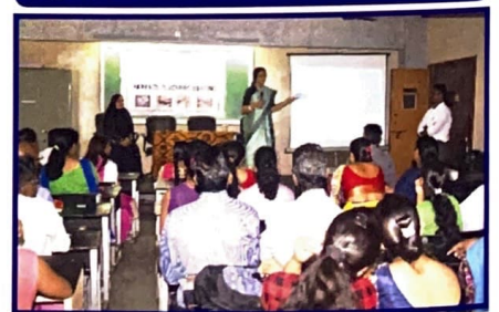
Meeting with the parents