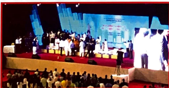
World Peace Conclave 13th August 2017